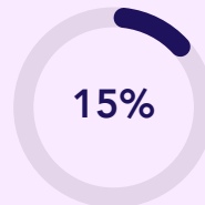
Students with Disability State=13%